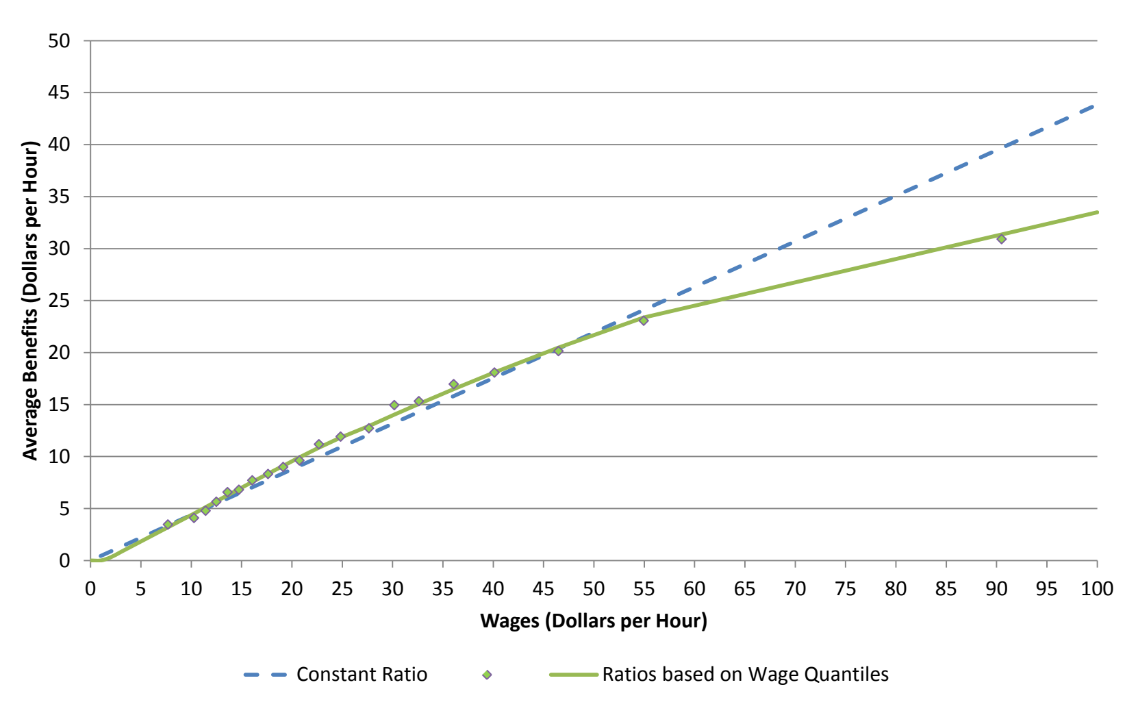
Figure 1. The Relationship Between Benefits and Wages in the Private Sector

Notes: Benefits were measured per hour worked in terms of the cost the employer incurred in providing them. Wages were measured per hour paid (the sum of hours worked and hours of paid leave). The dashed line measures benefits as 44 percent of wages, which is the ratio of total benefits to total wages in the National Compensation Survey (NCS). The markers represent the averages of benefits and wages in 20 quantile categories of the private-sector wage distributions, also from the NCS. The solid line was fitted to those averages using a kernel regression technique that preserved the average across quantile categories. That approach implied negative averages of benefits at very low wages, which were truncated just above zero.