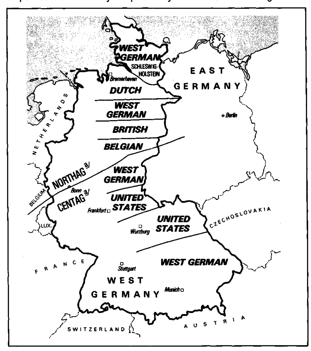
Figure 1. Corps Sectors of Military Responsibility in NATO's Central Region